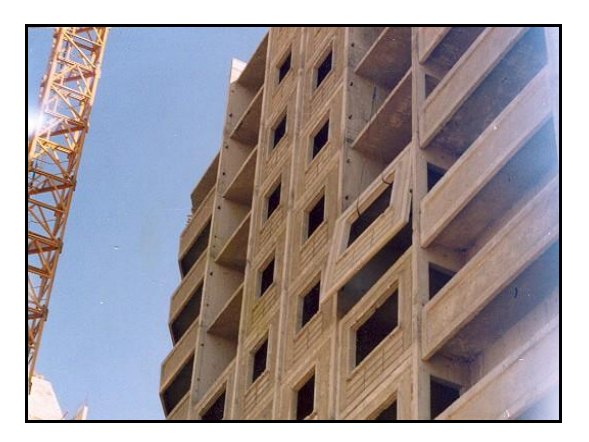
Photo 4. Carrying the precast panel wall to its place