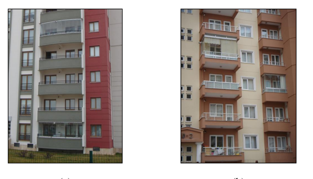
(a) (b) Photo 11. Facades with precast parapet wall balcony and metal balusters balcony

Aesthetic value composed on residential building facade by the usage of textured precast balcony panels in tunnel formwork system together with metal profiles and color-texture differences made in patches impinge on environmental quality in positive way (Photo 12-a). As to the residential buildings for which balconies with traditional elements and brick laid walls are used, monotony occurs in terms of visual side and an unexpressive facade characteristic emerges comparing with precast panel facade (Photo 12-b).