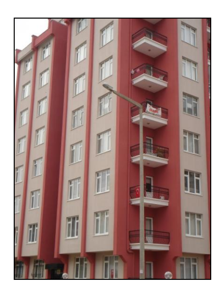
(a) (b) Photo 12. Harmony of balcony and wall elements on the facade