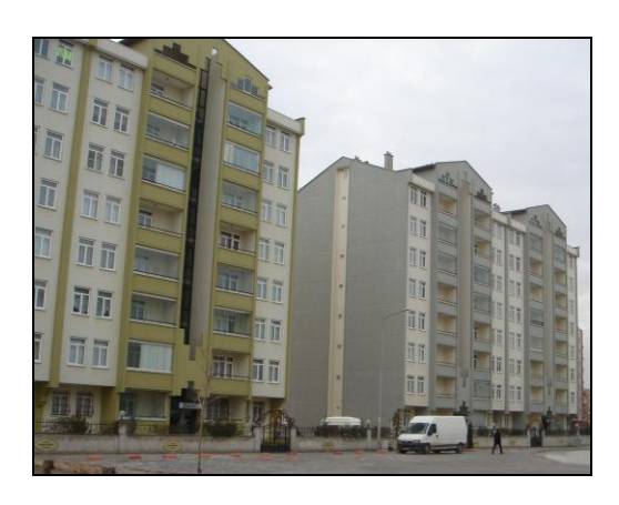
(a) (b) Photo 13. Housing blocks produced with tunnel formwork system