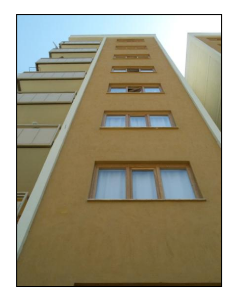
(a) (b) Photo 9. View of precast and brick facades