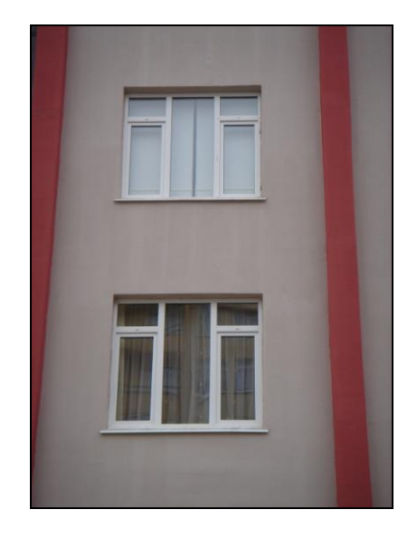
(a) (b) Photo 8. Precast and brick facade details

And in Photo 9, two different residence buildings' facades produced with tunnel formwork system are shown. Visual diversity that precast panel wall (a) and brick laid wall generate, is perceived when facade of the building is looked bodily in vertical. Plain facades are preferred since applications enabling aesthetic values (joint gap, doorjambs etc.) require extra cost and labor for brick laid wall facades (b). Therefore precast panel walls in tunnel formwork systems are used widely.