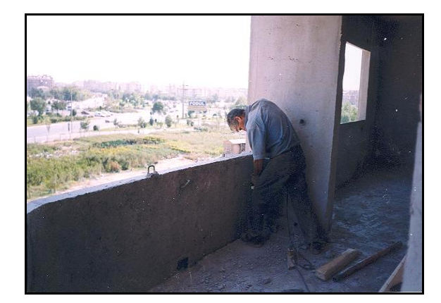
Resim 7. Assemble of precast balcony parapet walls in situ