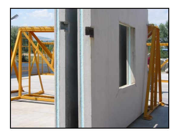
Photo 5. Sandwich panels having heat insulation material in the midst

In the situations that external insulation would be difficult to be made for precast panel walls with single layer (high buildings, cold climate regions), using sandwich panels can be looked as a solution. Sandwich panels are produced by placing heat insulation material between two concretes (Photo 5). While external panel provides aesthetic and insulation, inner panel acts as a bearing performing assemble to shear wall and floor (Photo 6).