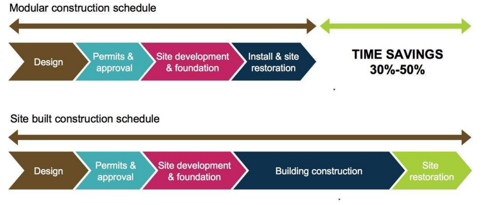
Fig.(1) Comparison between schedule of modular construction and traditional construction