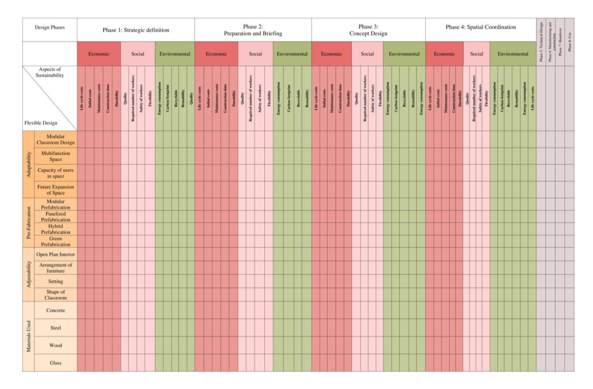
Fig. (4) Matrix showing correlation between Flexible design criteria and sustainability

Primary Public schools have a vital role towards developing a sustainable community. Despite its important role, the inflexibility of the traditional methods used in construction create social, economic and environmental challenges that makes the school unsustainable. Hence, flexible design is a proposed approach to achieve sustainability in Primary Public schools. The paper's methodology consists of qualitative data gathered from several reliable and valid sources in order to formulate a comprehensive literature review that would help to investigate the role of flexible design for achieving sustainability in primary public schools in Egypt through Green Prefabrication. Finally, the output is formulated in the form of a matrix which shows the correlation between flexible design criteria and the three pillars of sustainability as illustrated in figure (4).